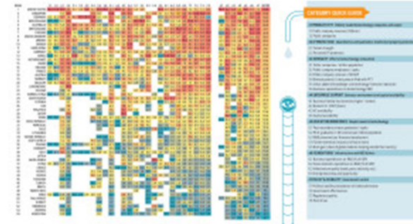
Fig: 2016 Scientific American Worldview ranking.

Denmark (3), Finland (7) and Sweden (9) give ScanBalt BioRegion a prominent representation at the top 10 of the list in overall biotechnology innovation according to the recently published 2016 Scientific American Worldview ranking.