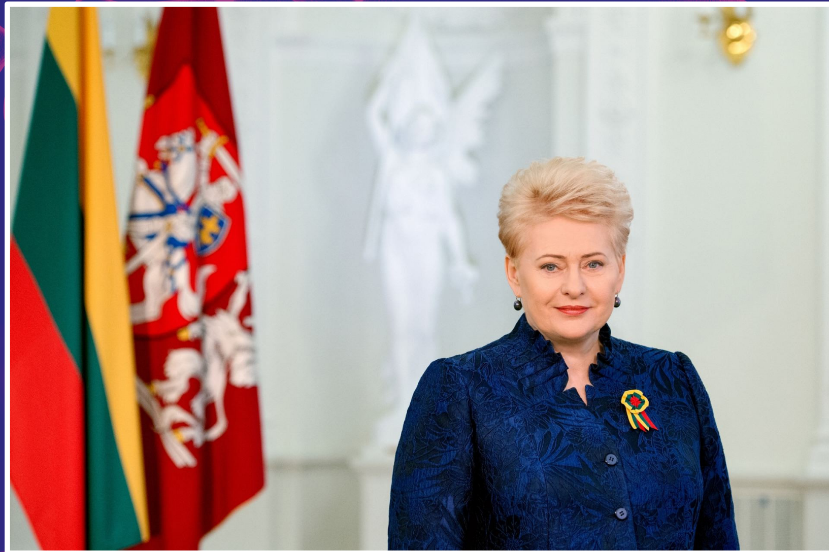
H. E. Dalia Grybauskaitė, President of the Republic of Lithuania