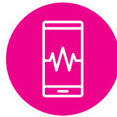
Achieving IT Literacy