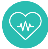
Achieving Health Literacy