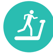
Applying online health information for health management in everyday life