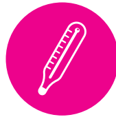
Appraising Online Health Information